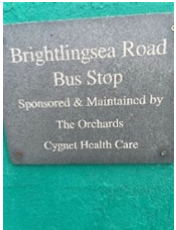
A dedicated plaque to recognise the hard work achieved.