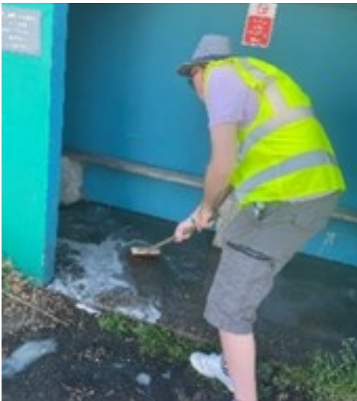
Work in progress!