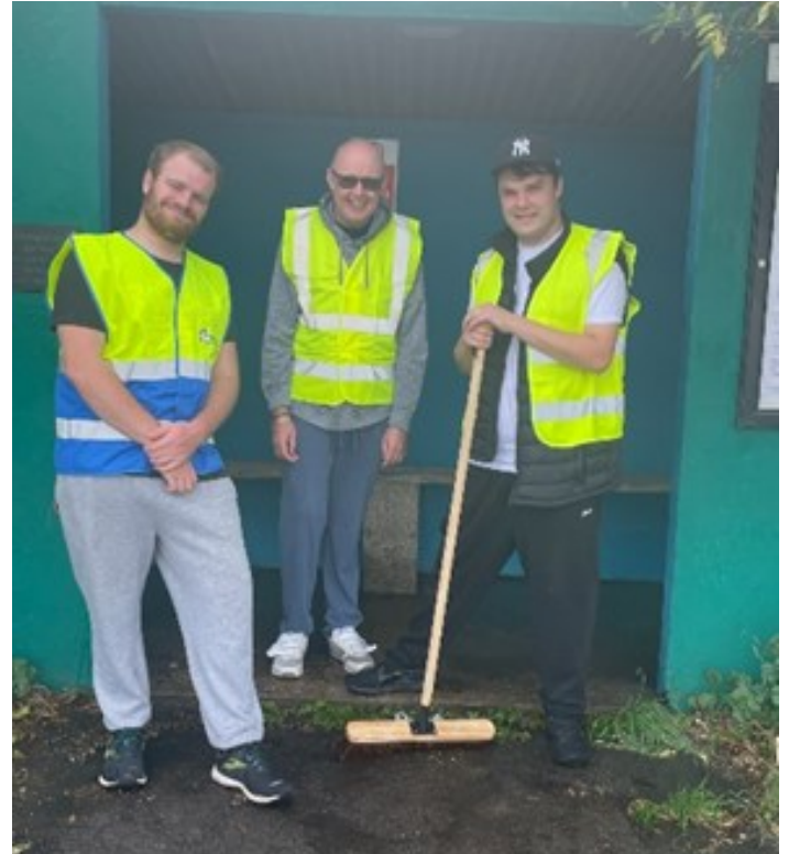
The residents who formed the QI project team at The Orchards