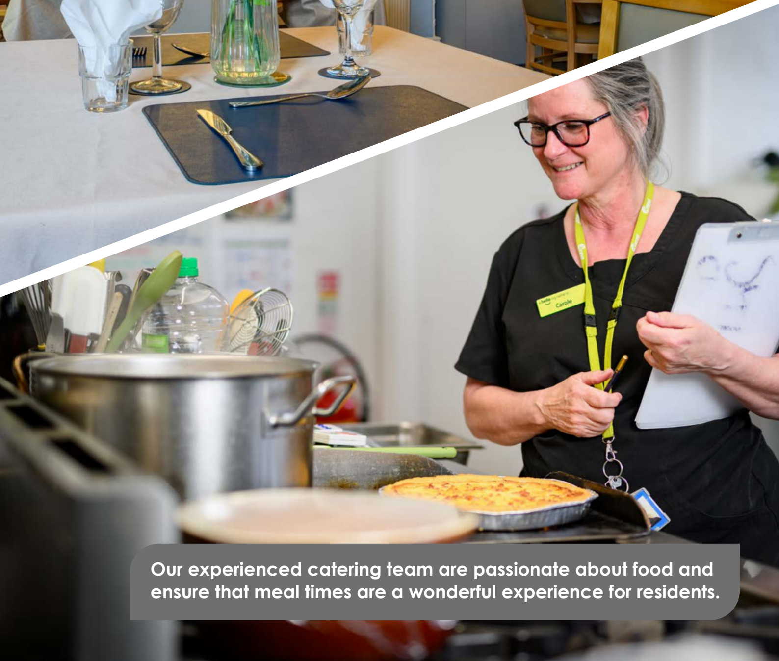
Our experienced catering team are passionate about food and ensure that meal times are a wonderful experience for residents.