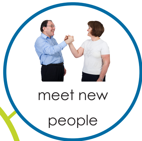
meet new people