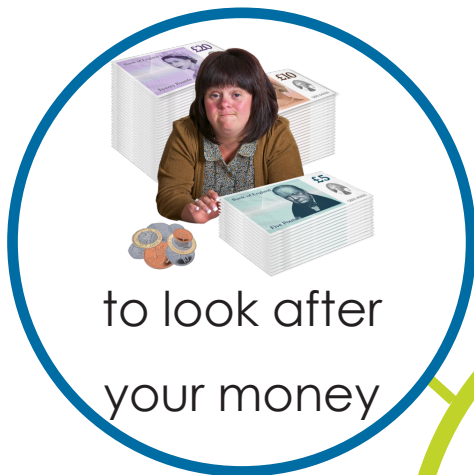
to look after your money